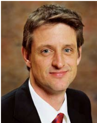
By: Simon Roberts Policy & Research Division

principles. The KFTC has a high status amongst the country's economic policy institutions, being autonomous but with the head of the KFTC having a seat in cabinet. I briefly comment on some of the features of competition policy in South Korea, drawing on meetings with members of the authority and competition practitioners.