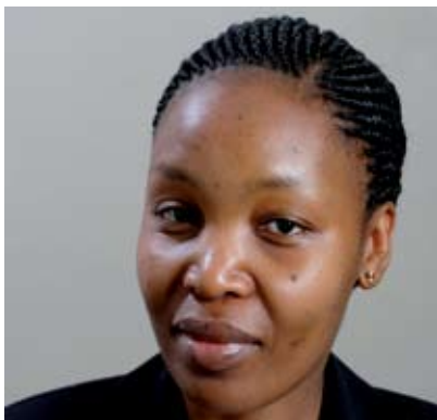
By: Nompucuko Nontombana Enforcement & Exemptions Division