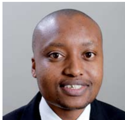
By: Itumeleng Lesofe Enforcement & Exemptions Division

The steel industry is among the sectors prioritised by the Commission in order to make a meaningful impact in the promotion of competition in the South African economy. The sector is identified for prioritisation because it is characterised by high concentration levels and high barriers to entry and therefore very limited competition or potential for entry. The recent increases in the price of steel have also meant that the sector has a huge impact on the competitiveness of downstream industries and, importantly, in driving up costs for