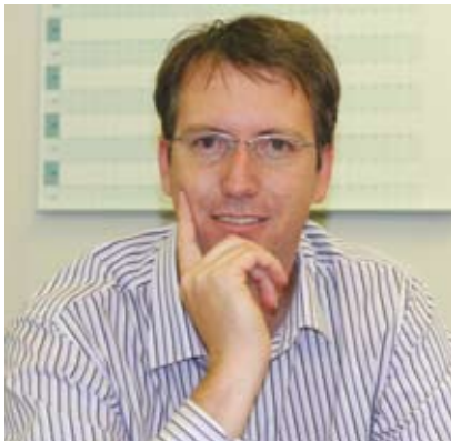
By: Maarten van Hoven

present higher incidence of chronic diseases, HIV related illnesses and diabetes. Schemes fail in attracting and maintaining the younger and healthier population and therefore have exposed themselves to frequent and higher claims.