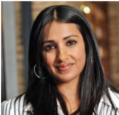
By: Reena das Nair

In line with its priority in curtailing cartel activity in the South African economy, the Competition Commission has recently extended its focus to practices that facilitate collusive agreements or that amount to stand-alone collusive or concerted outcomes. One such practice is the exchange of commercially sensitive information between competitors.