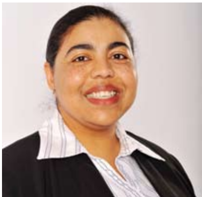
By: Rizia Buckas

For the past two years the Competition Commission has been investigating various parts of the steel industry. In the later part of 2009 four separate cartel cases were referred by the Commission to the Tribunal, relating to: the production and supply of long steel products; the supply of wire and wire products, the supply of mining roof bolts; and, the supply of wire mesh. Investigations continue into other parts of the steel industry such as the downstream supply of reinforcing bar, steel plate, steel traders, and tinplate.