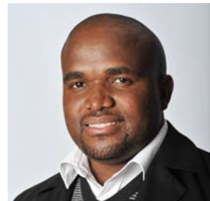
By: Shadrack Rambau

The sections mentioned above required the Commission to define the relevant markets in which the parties operated. The Commission identified two distinct markets during its investigation, namely, the market for the supply of airport facilities in which