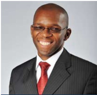
By: Bongani Ngcobo

therein in exchange for leniency. The Commission's investigations into the milling industry have identified two separate areas of cartel conduct to date. One relates collusion with regard to milled white maize (primarily for mealie meal), and the other relates to the milling of wheat (into flour). As well as being quite distinct products, generally made using different milling machinery, there are different participants. While the four major milling companies (also those involved in bread) mill both white maize and wheat, there are many more producers of white maize. Hence the cartel agreements involve different parties and products.