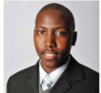
By: William Kganare

Around 2001 to 2002 producers agreed on the basis for the bitumen price and the way it would be adjusted. In a number of meetings between 2002 and 2007, primary producers formally