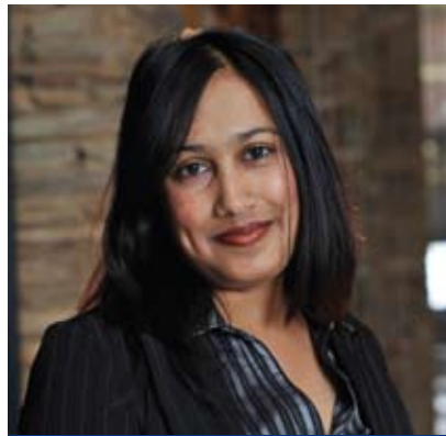
By: Nazeera Ramroop

Consolidation is a mixed blessing: Fewer schemes leave consumers with fewer choices. However, larger schemes present better economies of scale, improved stability of risk pools and facilitate the management of complex legislative provisions. In addition, larger medical schemes are able to more effectively negotiate prices with suppliers. Notwithstanding that better prices might be negotiated by these larger schemes the majority of the schemes remain ineffective which