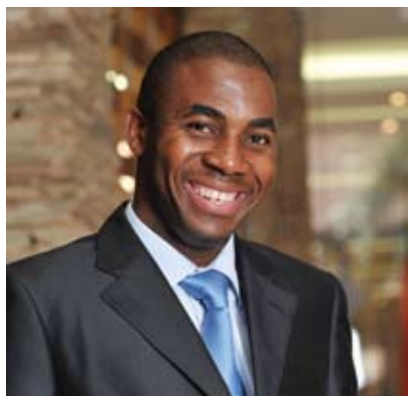
By: Thabelo Masithulela

During 2009 the Competition Commission had to consider the transaction between Aspen Pharmacare Holdings Limited (“Aspen”) and GlaxoSmithKline (GSK). In terms of the transaction filed in South Africa (which formed part of a broader international transaction) Aspen acquired control over the pharmaceutical business of GSK in South Africa. In return GSK became the single largest shareholder in Aspen holding 16% of the entire issued share capital of Aspen.