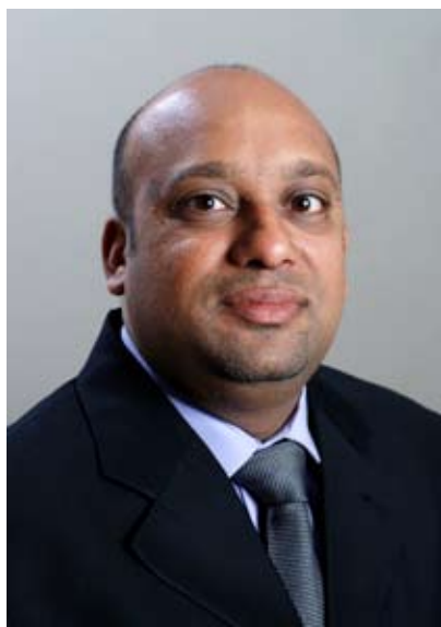
By: Avish Kalicharan

O n 6th January 2009, the Competition Tribunal approved a settlement agreement entered into between the Competition Commission ("Commission") and Foodcorp (Pty) Ltd ("Foodcorp") over the latter's participation in the bread cartel, which spanned over a number of years. This followed the Commission's investigation of a cartel in the bread industry which operated on a national level and involved both price fixing and market allocation.