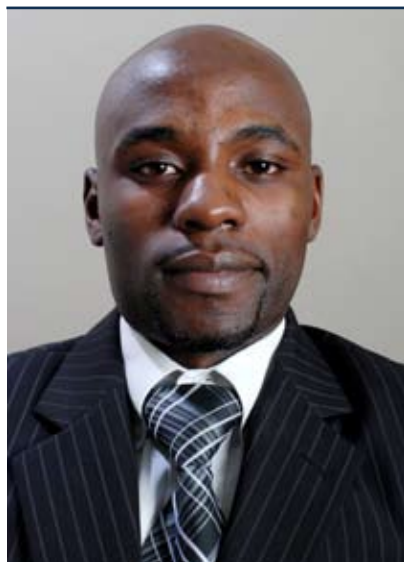
By: Mulalo Shandukani

The signed settlement agreement was on 04 November 2008 presented before the Tribunal and subsequently confirmed by the latter as an order of the Tribunal in terms of section 58(1) (b) of the Act, effectively lowering the curtain on the longest soap opera ever to grace its stage.