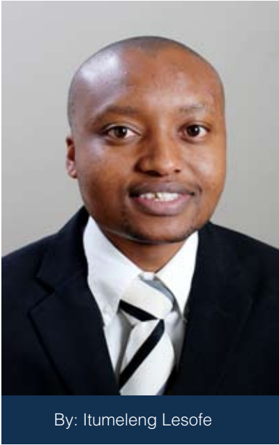
By: Itumeleng Lesofe