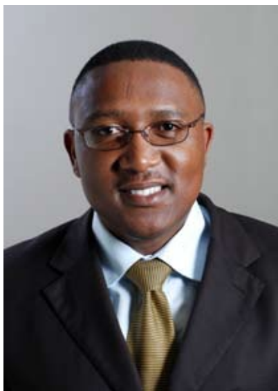
By: Dumisani Motsamai

D uring the first week of November 2008 the Competition Commission (“the Commission”) announced a consent order agreement between itself and the American Natural Soda Ash Corporation (“ANSAC”), bringing to an end what had been the longest pending case in the history of the Commission. 1