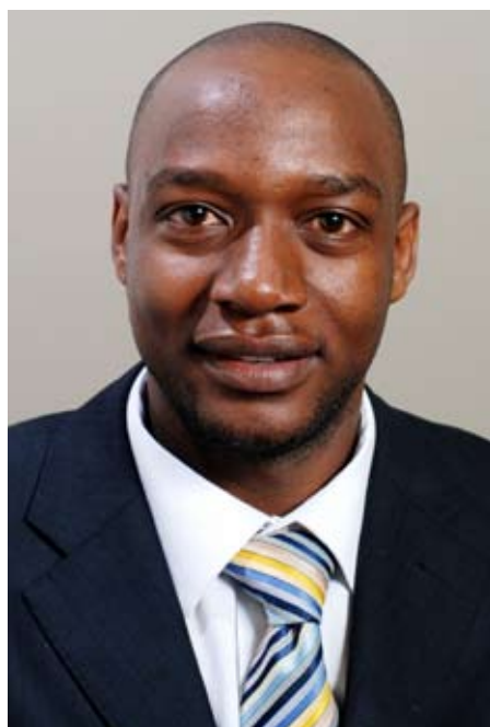
By: Grashum Mutizwa

The transaction was the subject of an intervention application in the Competition Tribunal.