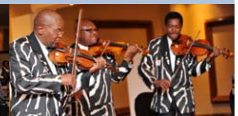
Soweto String Quartet