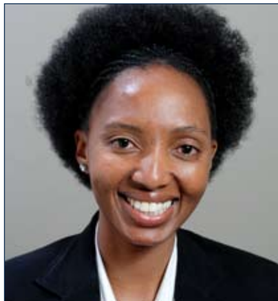
By: Nandi Mokoena

From 3 - 5 June 2009 members of the International Competition Network (ICN) held their 8th Annual Conference in the beautiful city of Zurich, Switzerland. More than 450 participants coming from nearly 80 different countries took part in