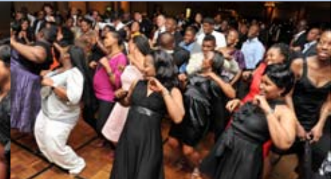
Dancing to Lira