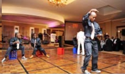
10111 Pantsula Dancers