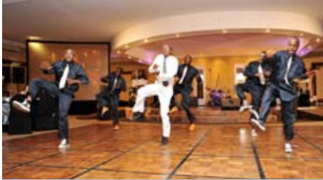
10111 Pantsula Dancers