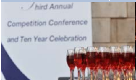
Welcoming drinks at the cocktail function launching the Ten Year Review Book.