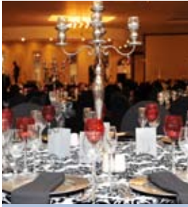
Gala dinner table setting