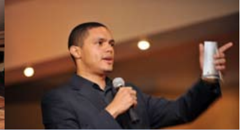
MC Trevor Noah