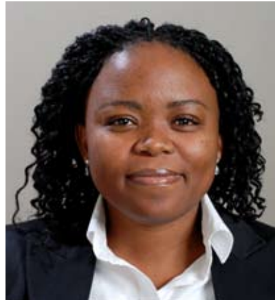
By: Molebogeng Taunyane

The first of September marked the 10 th anniversary of the coming into effect of the Competition Act and the Competition Commission and Competition Tribunal 'opening their doors'. Over the past decade the Competition Commission moved from being a relatively unknown entity – as there was a lack of awareness of the Competition Act - to a prominent feature in dinner table conversations. The high profile attained by the Commission is associated with taking on major competition cases and addressing concerns close to consumers' hearts.