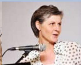
Rietsie Badenhorst (Competition Tribunal, SA)